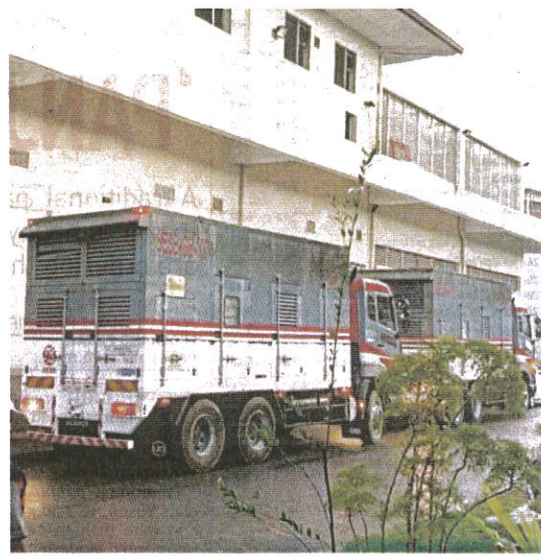
Sabah Electricity Sdn Bhd (SESB) mobile generator sets supplying power to Hospital Queen Elizabeth in Kota Kinabalu yesterday.