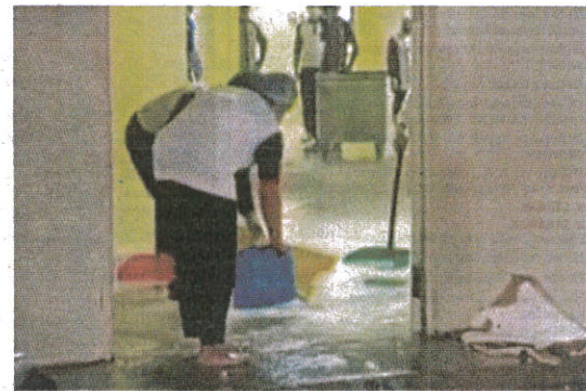
Hospital Queen Elizabeth 2 staff clearing water out from the hospital in Kota Kinabalu yesterday.